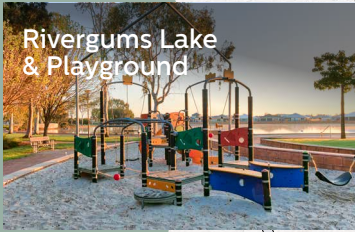
Rivergums Lake & Playground