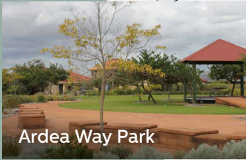
Ardea Way Park