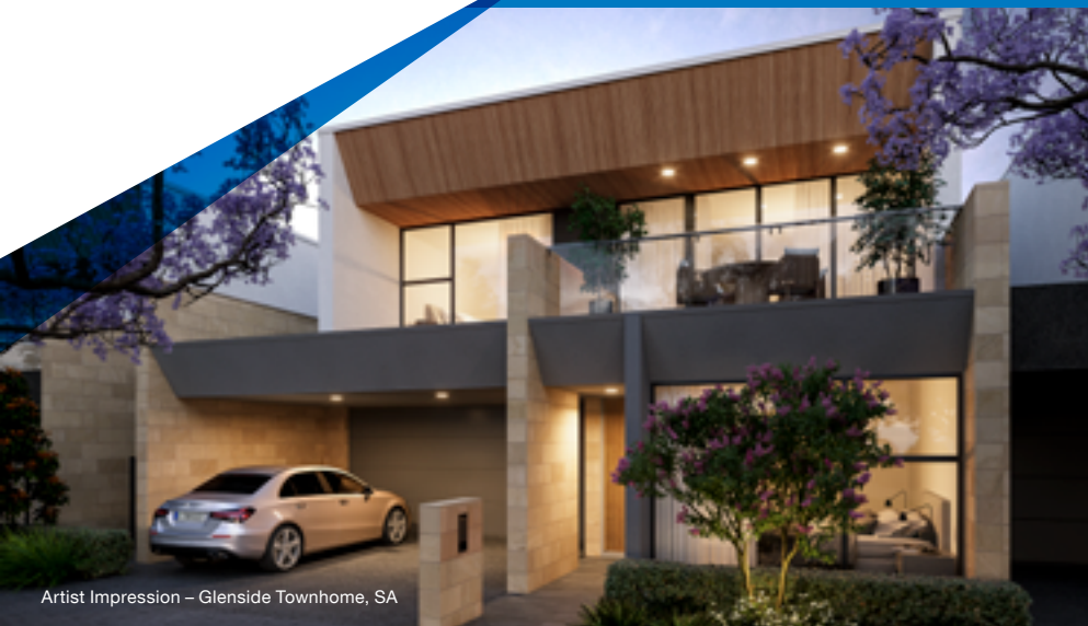
Artist Impression – Glenside Townhome, SA