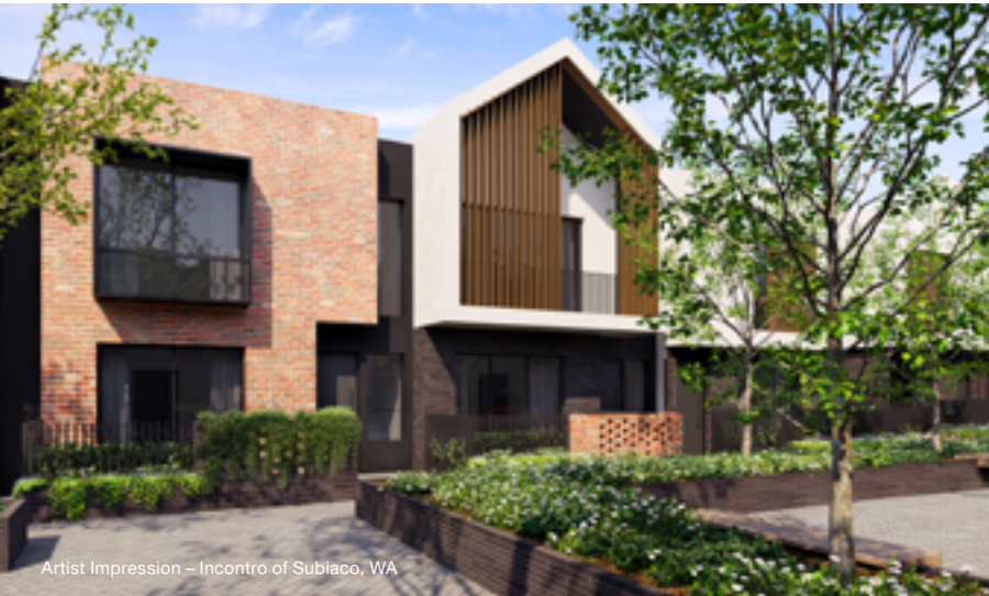
Artist Impression – Incontro of Subiaco, WA

Cedar Woods brings quality townhome designs to Western Australia with the successful launch of Incontro of Subiaco .