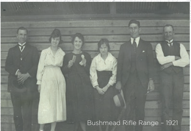
Bushmead Rifle Range - 1921